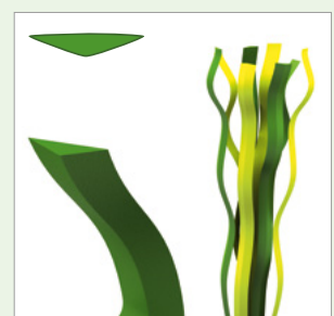
Fibre thickness: approx. 255 µm